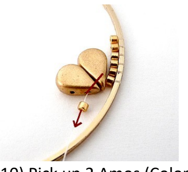
10) Pick up 2 Amos (Color 1), 1 DB