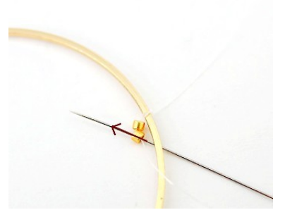
3) Pass through left DB