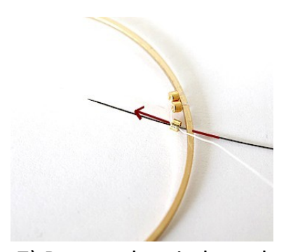
7) Pass under circle and through DB