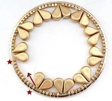
14) You have a total of 10 hearts (20 Amos). Pick up 11 DB