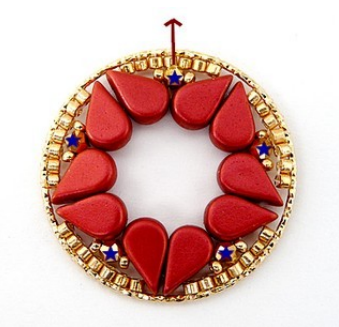
20) Repeat steps 16 and exit through central DB