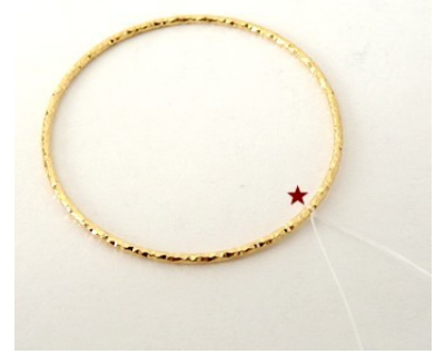
18) Part 2 : Make a knot in your circle