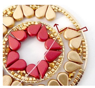
23) Pass under the circle, and through all seed beads again