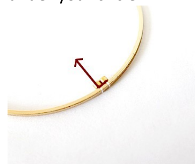
5) Exit through left DB