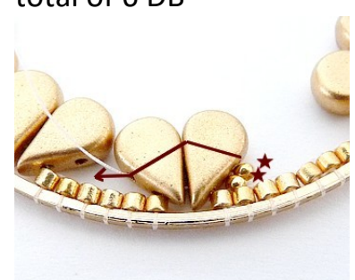
15) Exit through the last DB and pick up 2 R15, pass through top hole of 2 following Amos