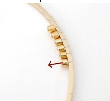
9) Place a total of 6 DB