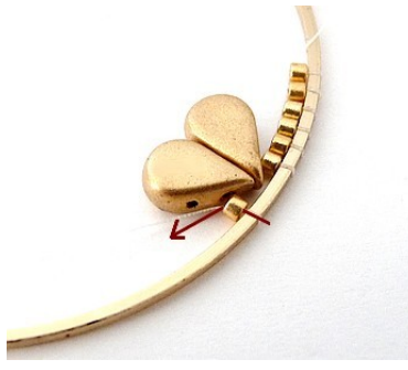
11) Pass up and under your circle and through last DB