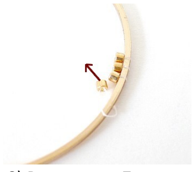
8) Repeat step 7