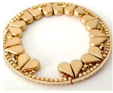
17) Repeat step 16 for the length of the pattern. Pick up 2 R15 like 15 and close your work