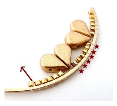
13) Repeat alternately steps 10 and 9