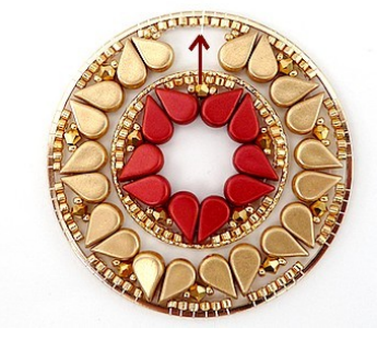
21) Place element 2 with element 1