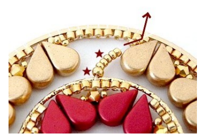
22) Pick up 1R11, 5 R15, exit through 2R15 (before the Amos)