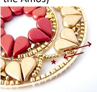
25) Pick up 5 R15, exit through 2R15, pass under the circle, and through all seed beads again, closeyour work