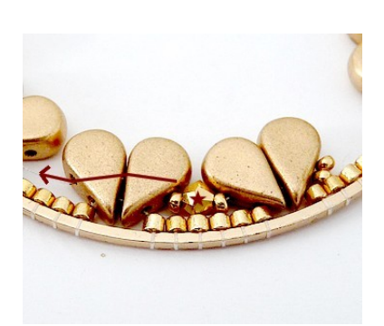
16) Pick up 1 R15, 1 T3, 1 R15, pass through top hole of 2 following Amos