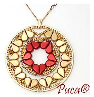
27) Congratulations! You have finished your pendant!