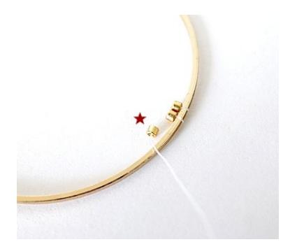
6) Pick up 1 DB, pass thread up the circle