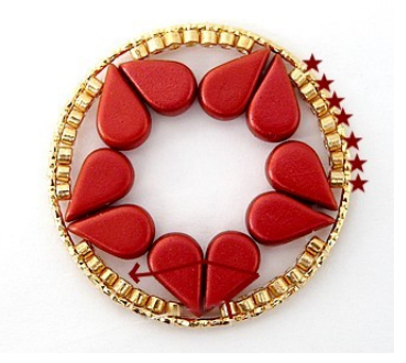
19) Repeat steps part 1 but with 7 DB