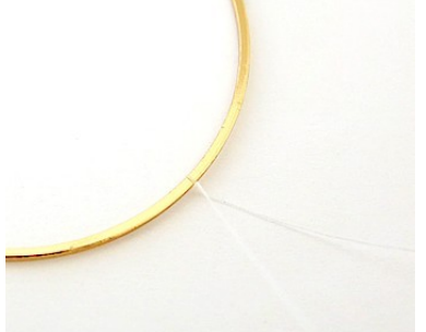
1) Part 1 : Make a knot in your circle