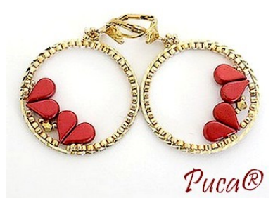
28) For earrings: 2 x 30mm circles, 8 Amos. Pick up 7 DB between Amos like part 2

Happy beading! Thank you for respecting my work ©